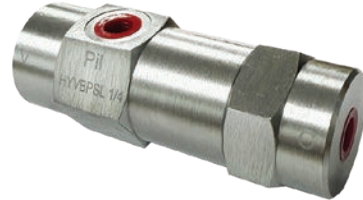
Single Pilot Operated Check Valves - 3 Way, In Line